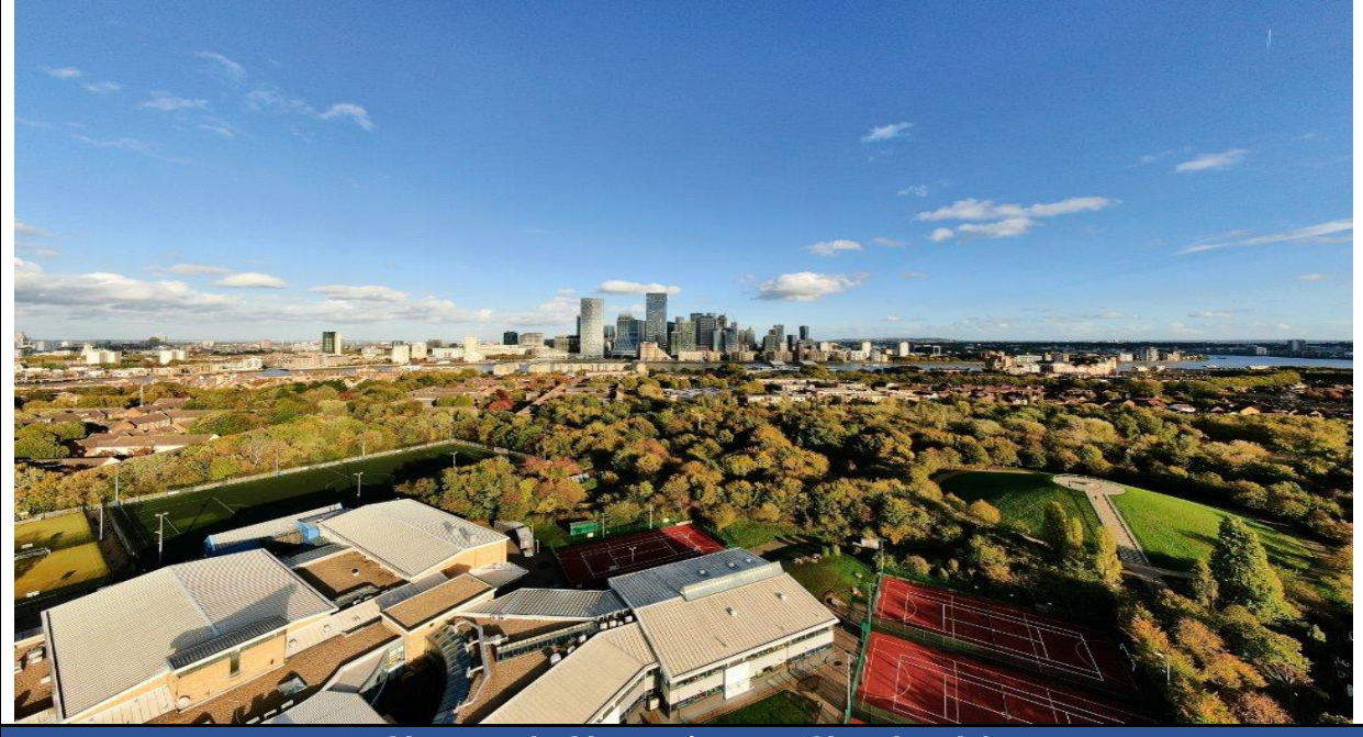
Classwork Champions & 'Shout outs'